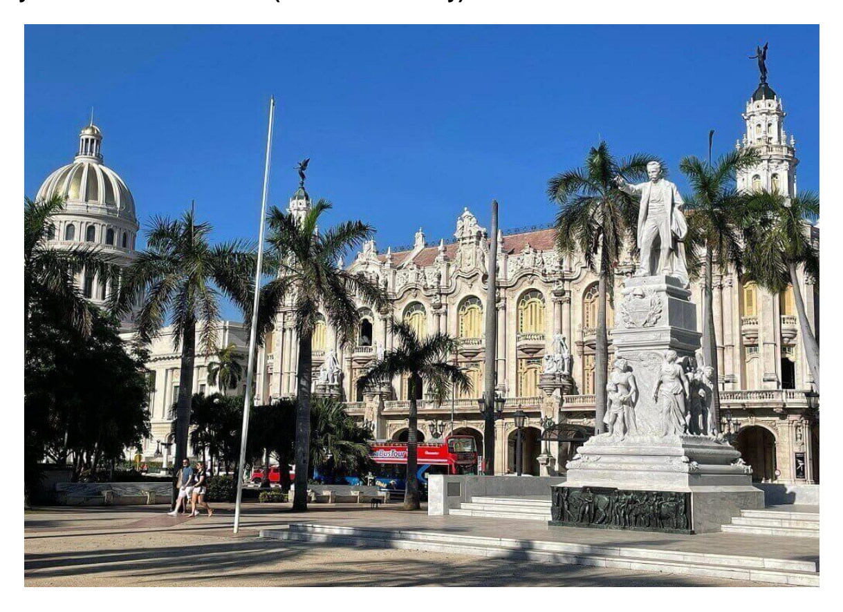
Day 3. Havana and the F.A.C (Cuban Art Factory)