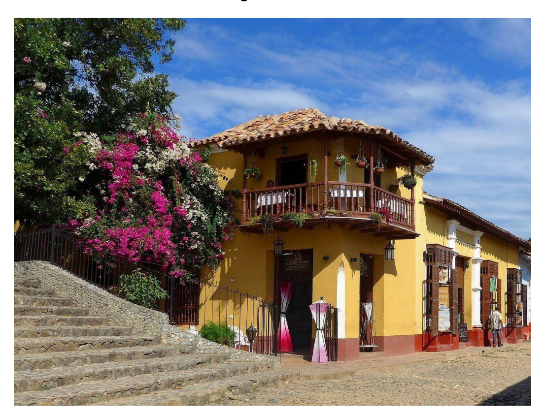
Day 8. Trinidad – UNESCO World Heritage site