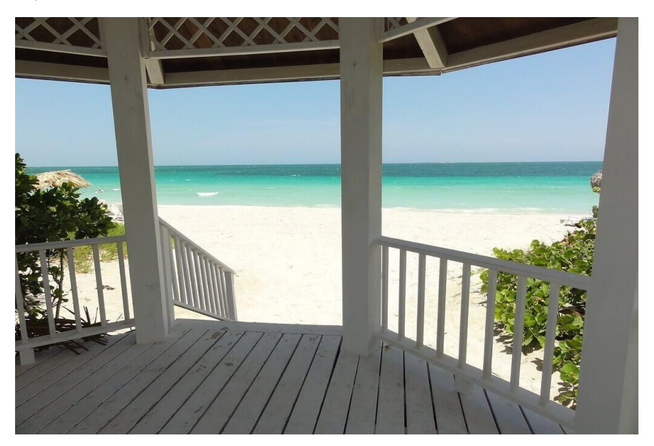
Day 10. Transfer from Trinidad to Havana