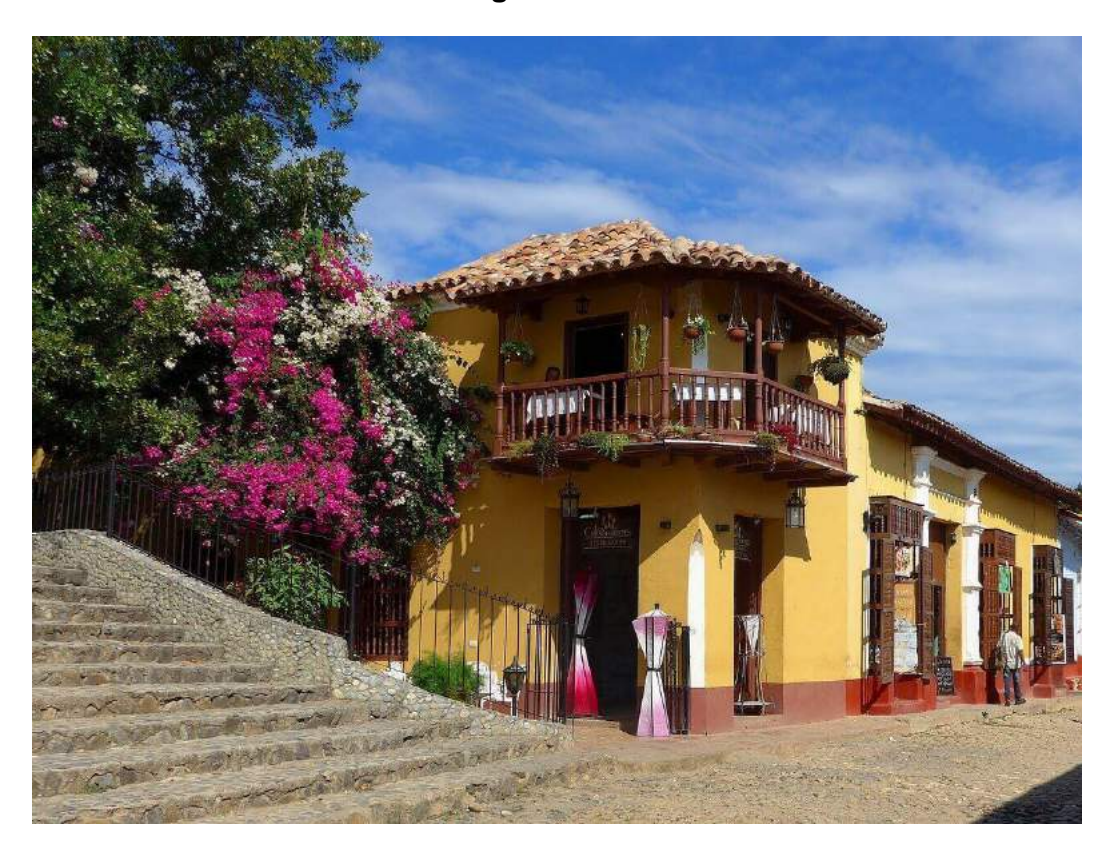
Day 7. Trinidad – UNESCO World Heritage site