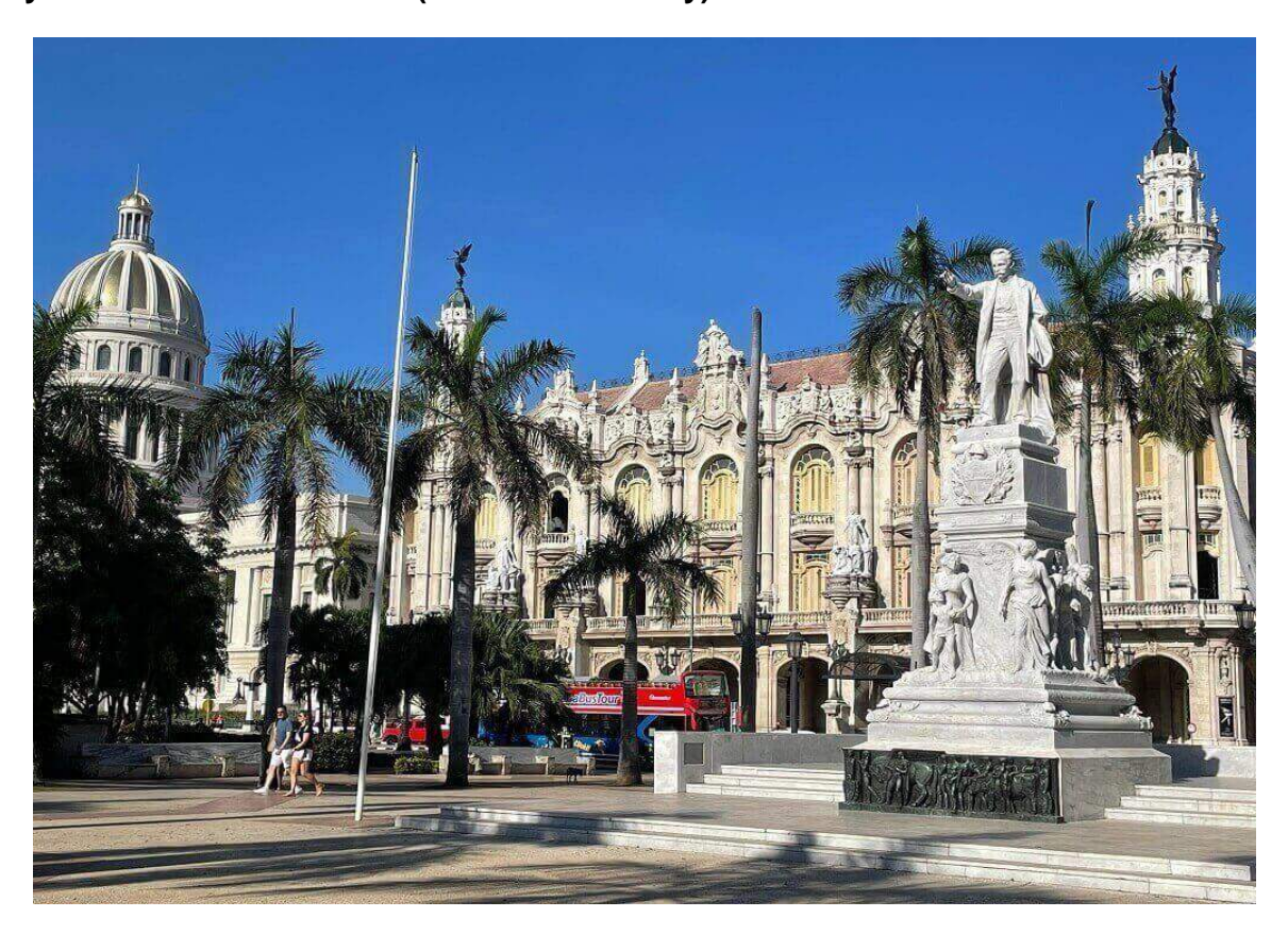
Day 3. Havana and the F.A.C (Cuban Art Factory)