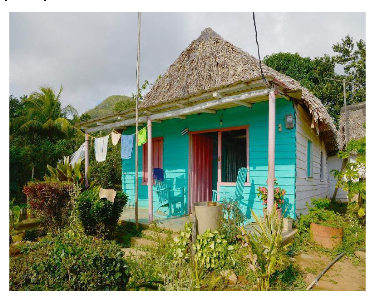
Day 5. Valley of Viñales