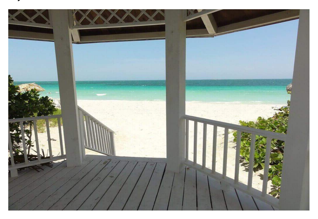
Day 9. Trinidad to Santa Clara