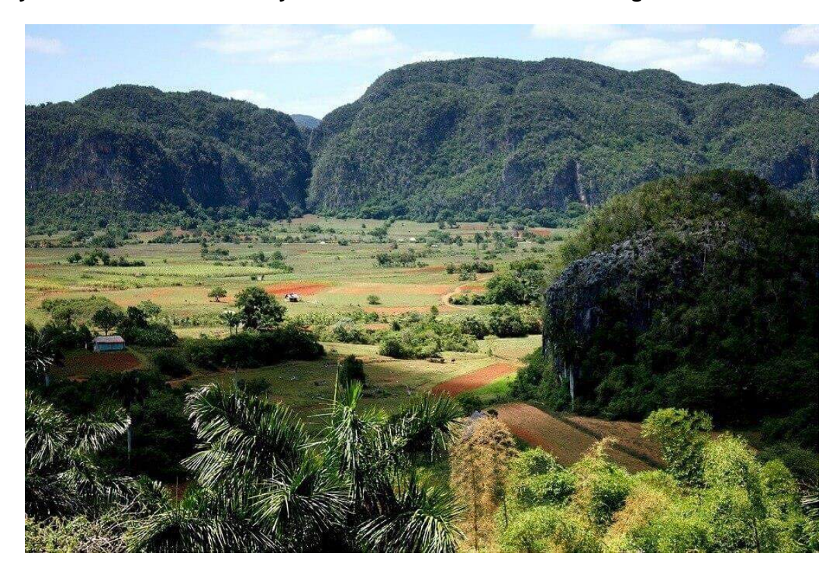
Day 4. Las Terrazas and Valley of Viñales - UNESCO World Heritage site