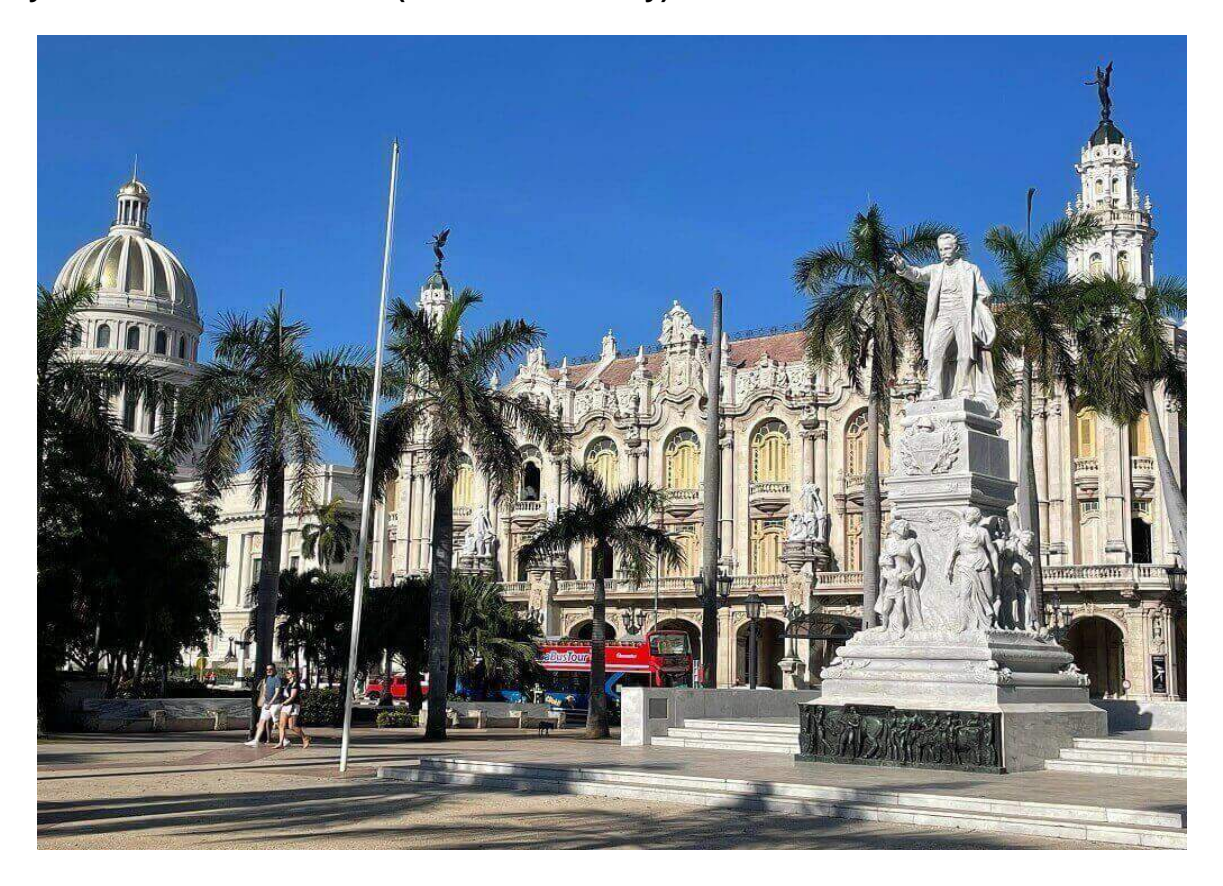
Day 3. Havana and the F.A.C (Cuban Art Factory)