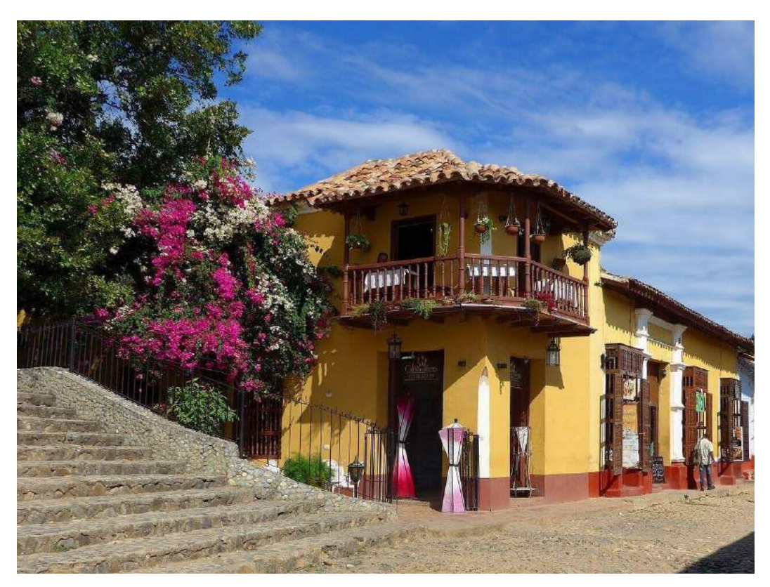
Day 7. Trinidad – UNESCO World Heritage site