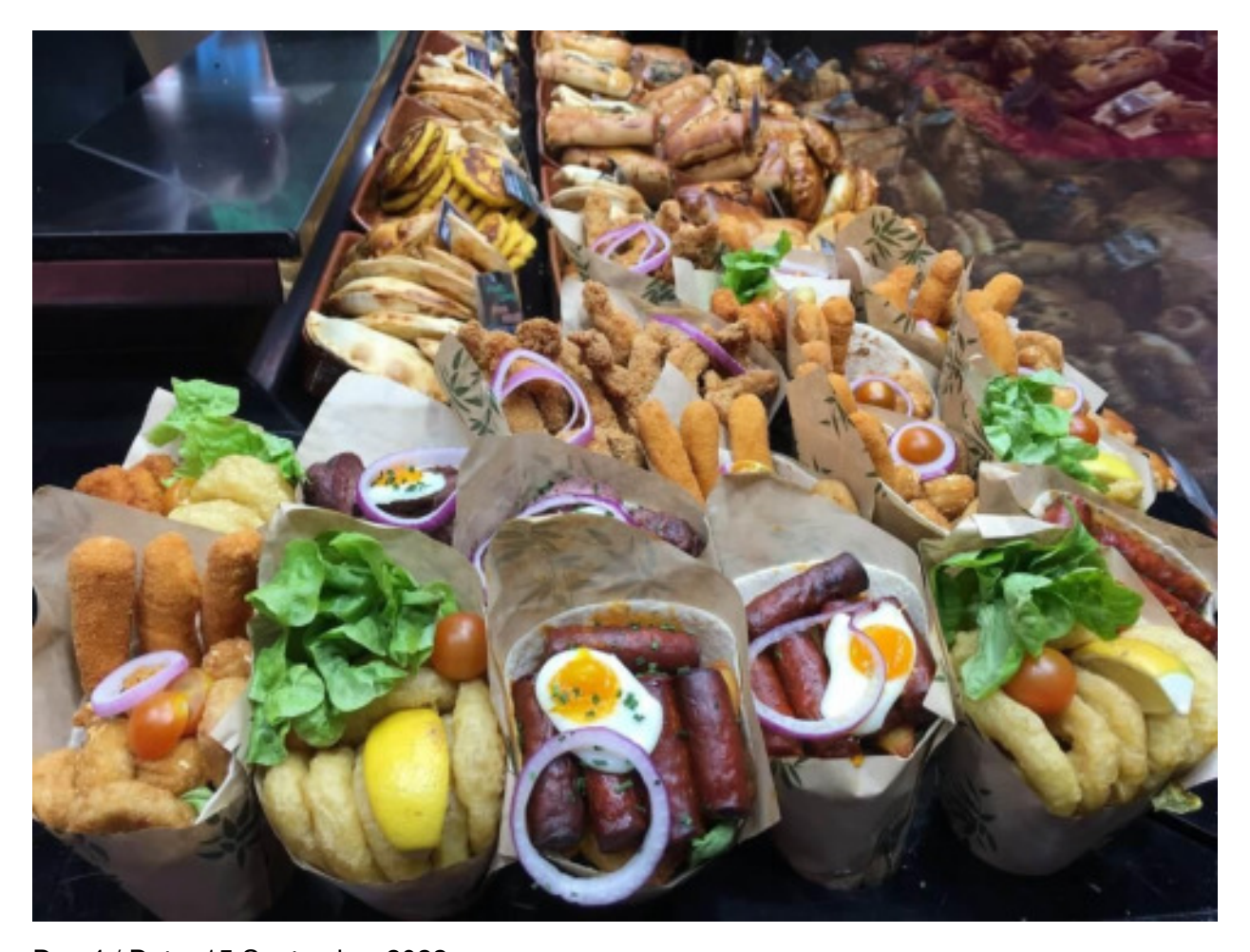
Day 4 / Date: 15 September 2022