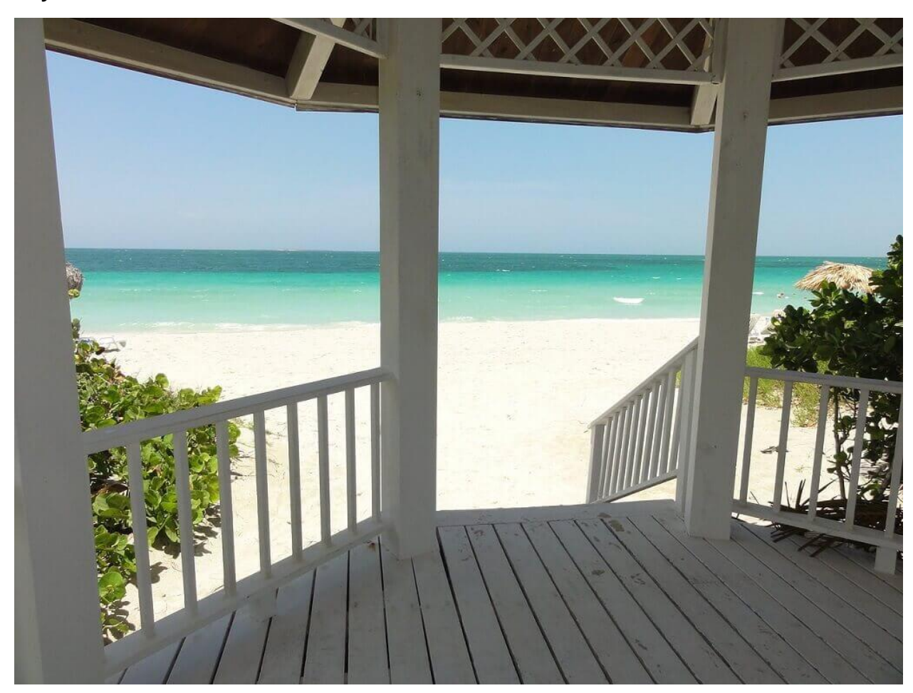
Day 10. Matanzas and Varadero