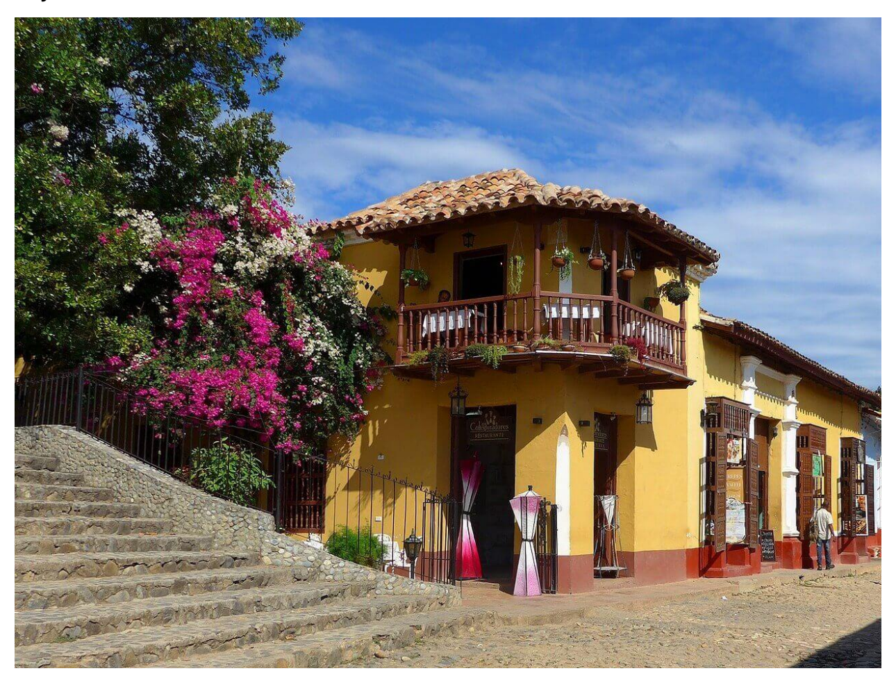
Day 7. Time travel to the 17th in Colonial Trinidad