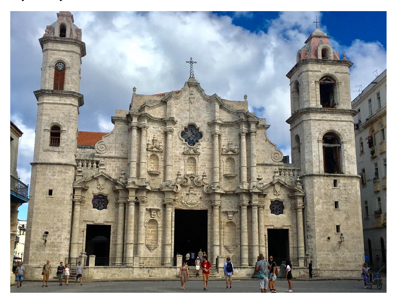
Day 5. Valley of Viñales and return to Havana