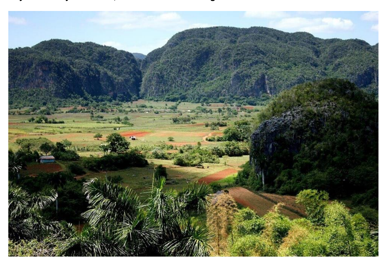
Day 4. Journey to Viñales, UNESCO World Heritage Site