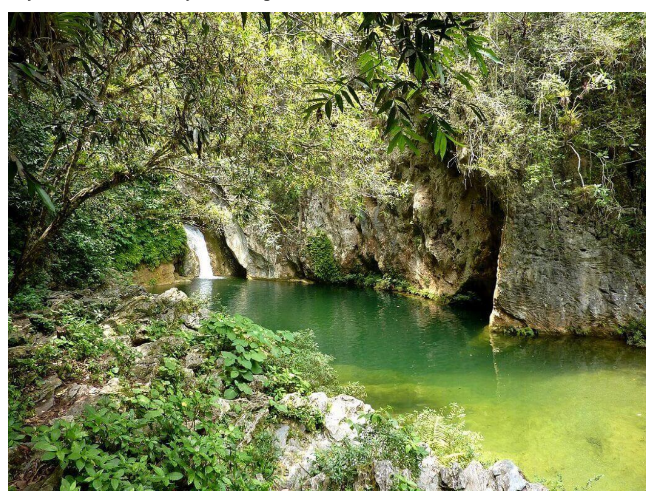
Day 8. Trinidad and Valley of the Sugar Mills