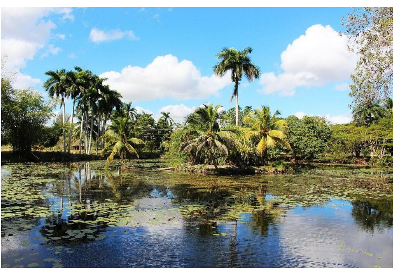
Day 6. Bay of Pigs and National parks. For those on the Trinidad extension.