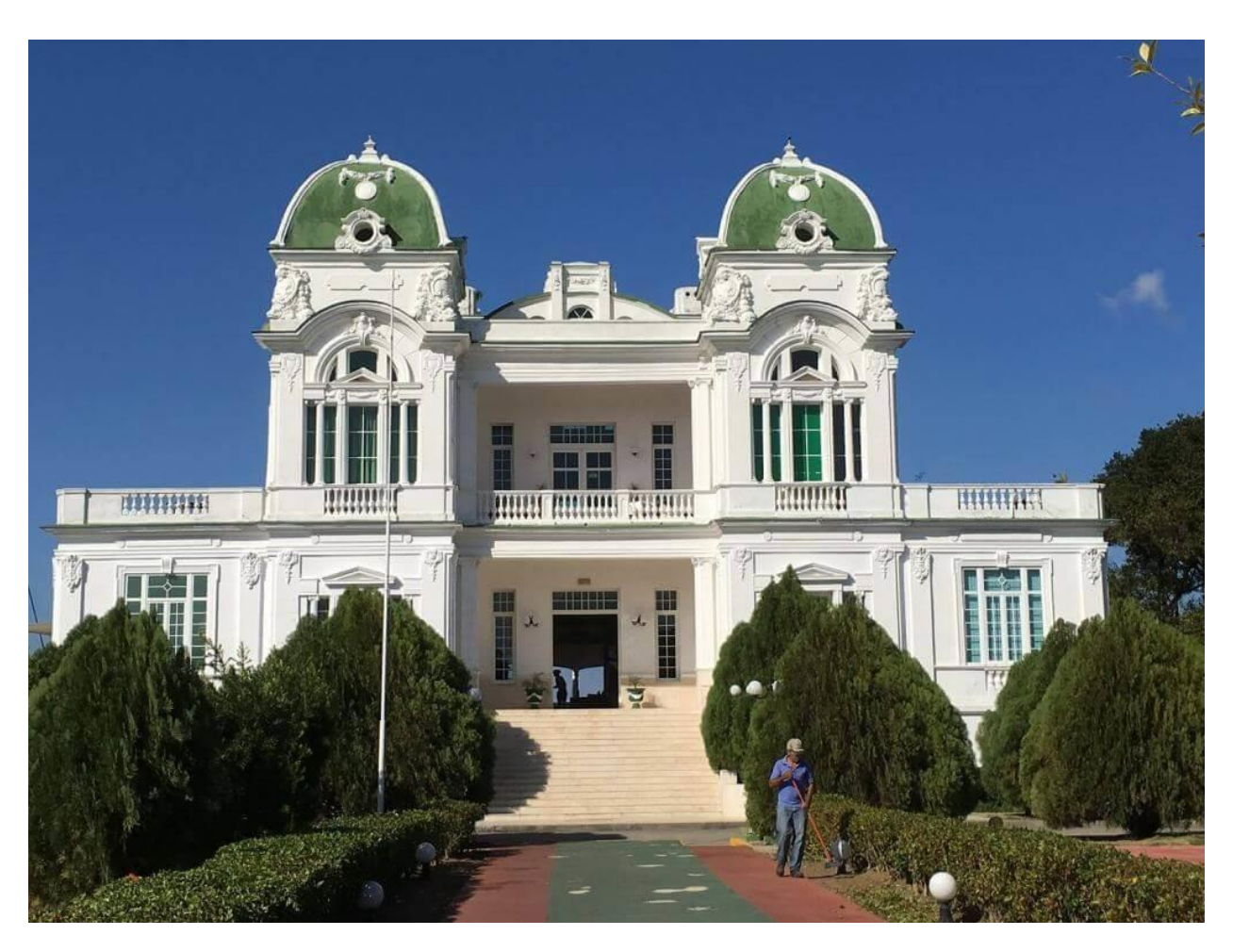
Day 9. French influenced Cienfuegos