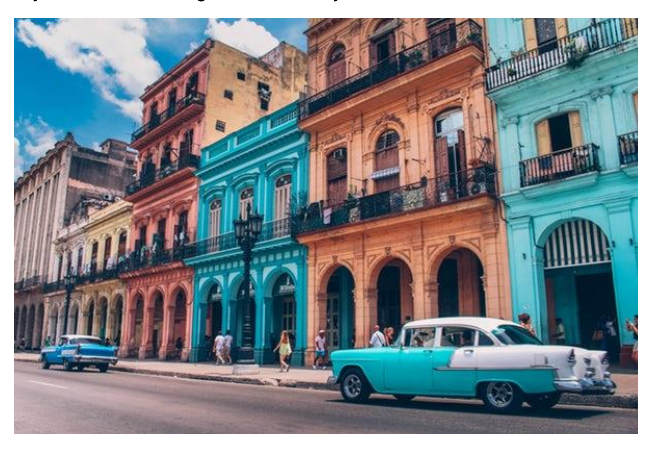
Day 2. Eastern Havana neighborhoods and beyond