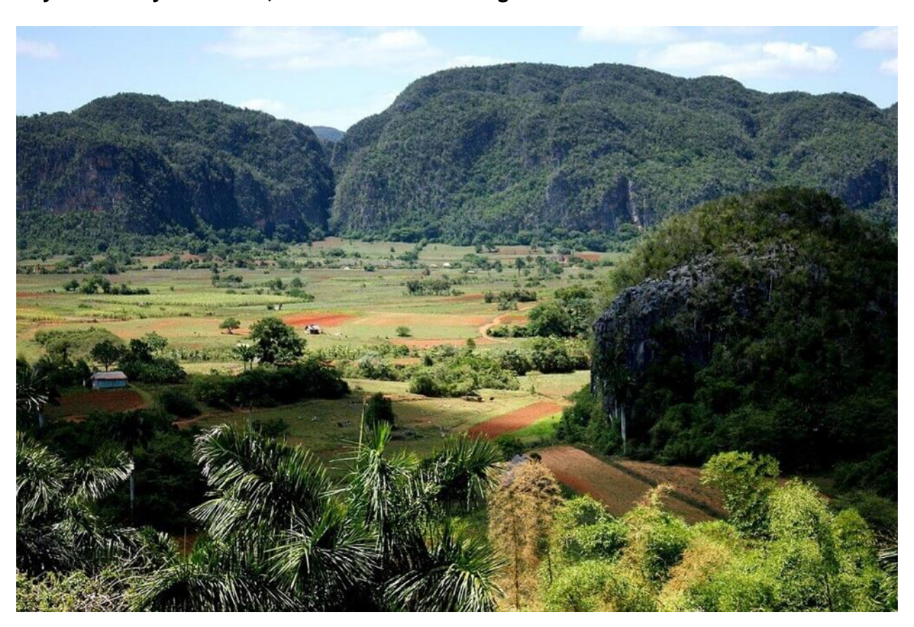
Day 3. Journey to Viñales, UNESCO World Heritage Site