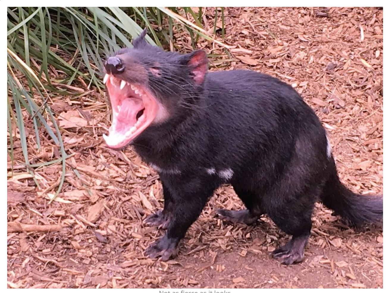
Not as fierce as it looks

An easy day trip from Hobart, Bonorong is a sanctuary in every sense of the word. Operating without any government funding, it takes in wounded and other compromised animals and rehabilitates them. After they are nursed back to health, the animals get to live out the rest of their days in safety and comfort.