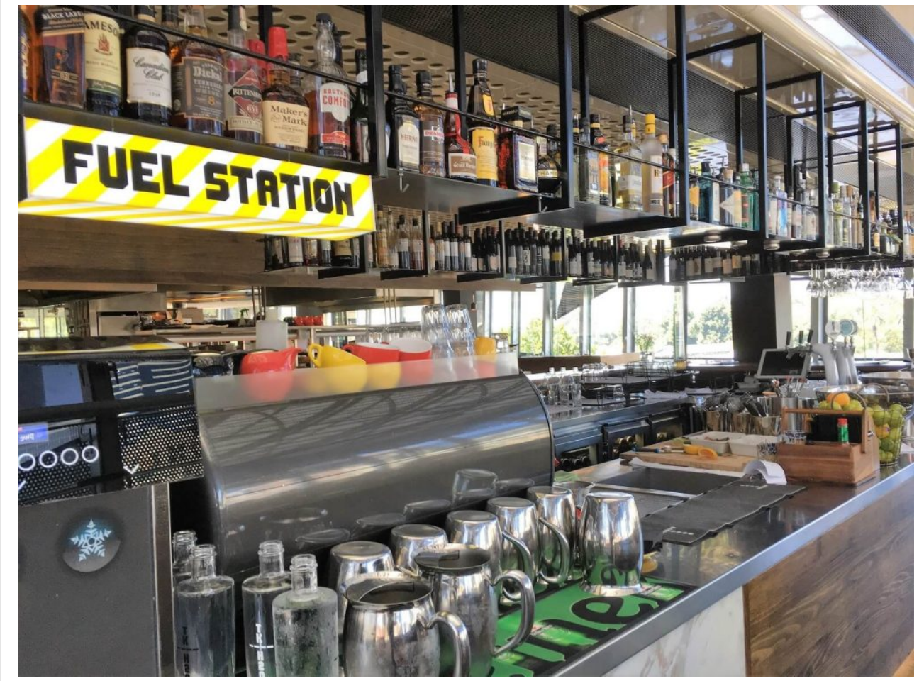
Terrific Asian influenced restaurant in Federation Square. If you can get in!