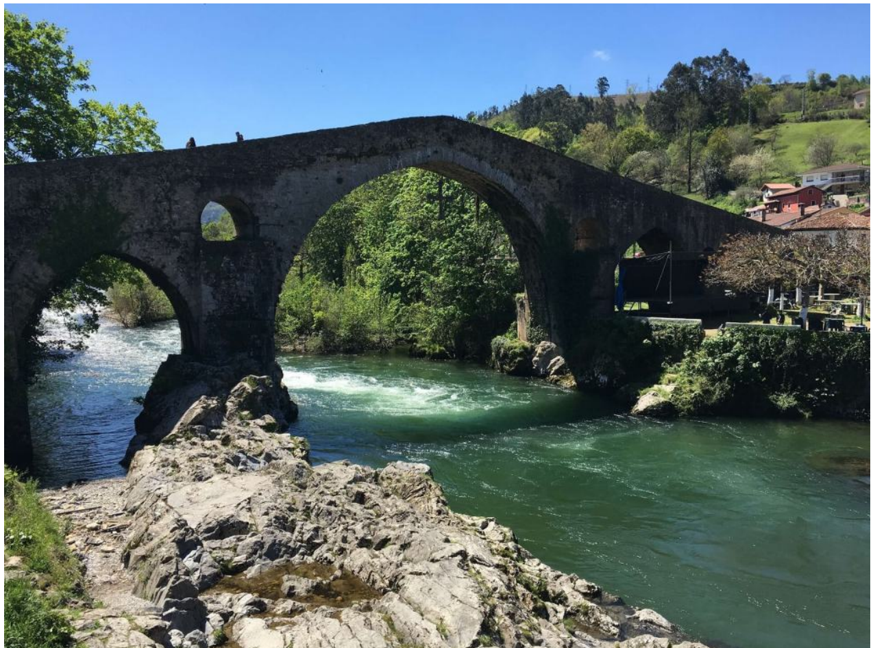
Roman bridge in Cangas de Onis in Asturias, northern Spain

The time in these locations can be adjusted to a 2 or 3-week itinerary in Spain or more depending on your time and interests. Or they can be compartmentalized for several unique Spanish itineraries. The assumption is you'll be traveling by car which for purposes of this trip is the best way to travel in Spain.